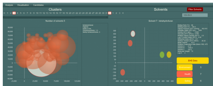
FIGURE 1 SUSSOL application Clustering screen